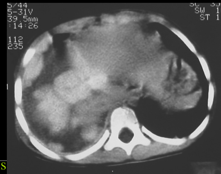
Adrenal neuroblastoma with pleural metastasis